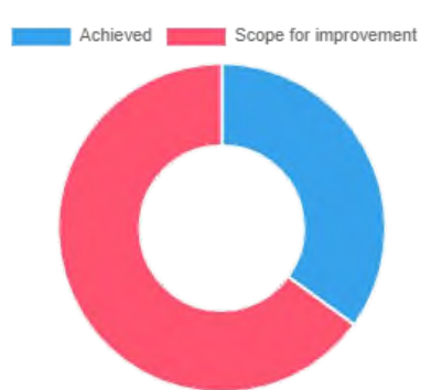
Achieved 35.00 | Scope for improvement 65.00