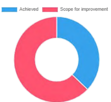
Achieved 37.23 | Scope for improvement 62.77